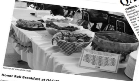
Honor Roll Breakfast at QACHS Cupcakes and doughnut holes were also served at the Honor Roll/Attendance Breakfast. Business who contributed to the event are named on the pictured card along with the QACHS Parent Teacher Student Association, who helped organize the breakfast.